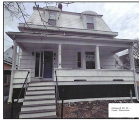
23 Glenwood Road

The HPC need to make determinations of whether the structure is to be preferably preserved and adopt findings.